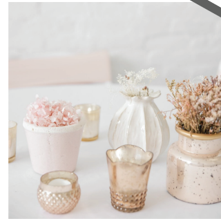
"Oh So Blush" Decor Package