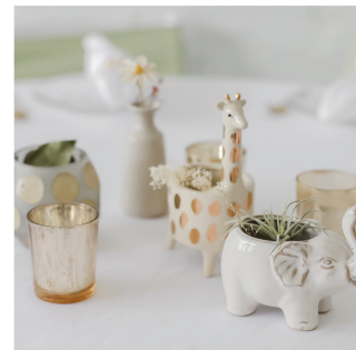
"Oh So Wild" Decor Package