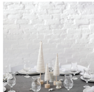
"Oh So Merry" Decor Package