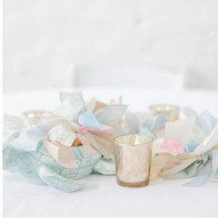
"Oh Turtley Cute" Decor Package