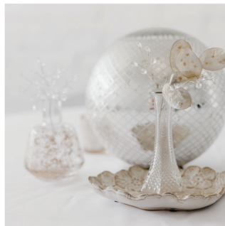
"Oh So Timeless" Decor Package