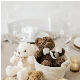
"Oh Beary Cute" Decor Package