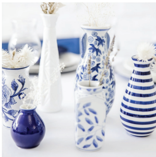
"Oh Willow" Decor Package