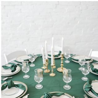
"Oh Emerald" Decor Package