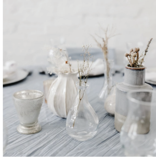
"Oh Something Blue" Decor Package