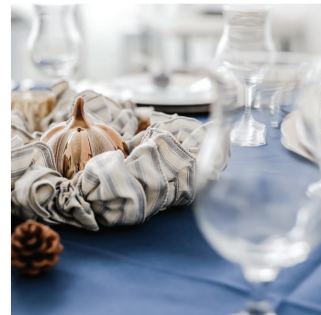
"Oh Pumpkin" Decor Package