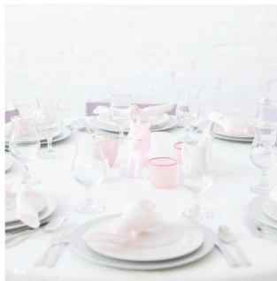
"Oh Glow Girl" Decor Package