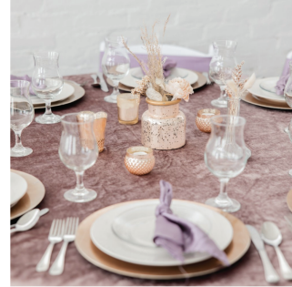
"Oh Darling" Decor Package