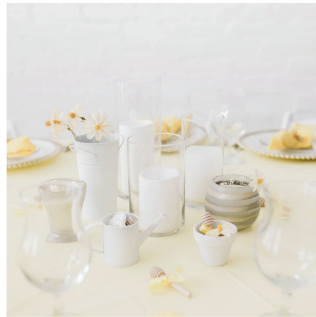
"Oh Honey" Decor Package