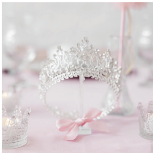
"Oh Princess" Decor Package