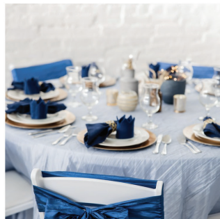
"Oh Little Prince" Decor Package