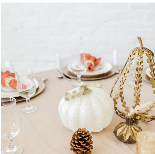
"Oh So Fall" Decor Package