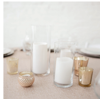
"Oh So Glam" Decor Package