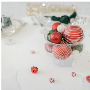
"Oh Greatest Time of Year" Decor Package