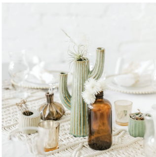
"Oh Boho" Decor Package