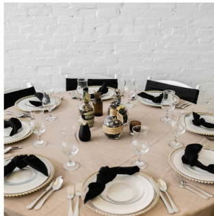
"Oh KY" Decor Package